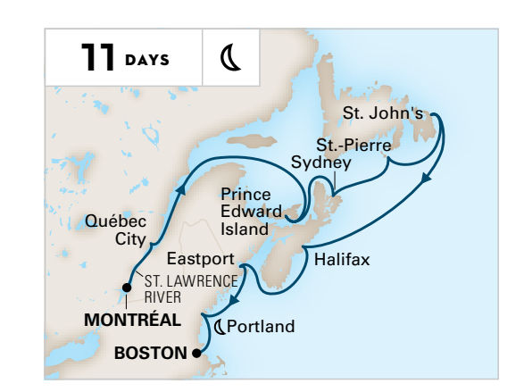
NEW ENGLAND. NEW FRANCE & NEWFOUNDLAND: ST. JOHN'S MONTRÉAL TO BOSTON Volendam Aug 27

Did you know that the 1781 "Siege of Yorktown" is widely considered the decisive battle that led to the American Continental Army's victory over the British? Admire Yorktown's lovingly preserved colonial homes and historic battlefields or transport yourself back to the 18th century in Colonial Williamsburg – the U.S.'s largest outdoor educational living museum that keeps alive the story of American independence.