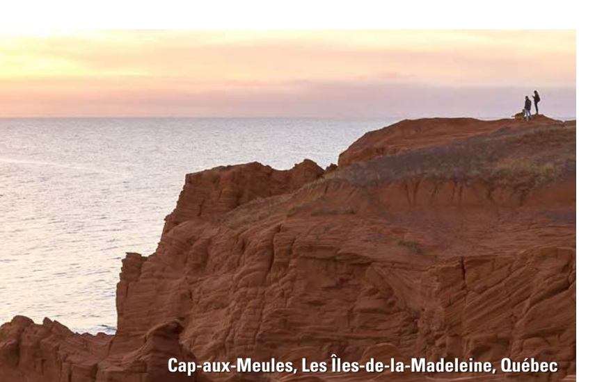
COME ALIVE IN CAP-AUX-MEULES

Did you know that tiny Cap-aux-Meules is home to North America's second-largest wooden church? The wood used to build St. Pierre de La Vernière was retrieved from one of the area's many 19th-century shipwrecks and had to be blessed before being used. Hear more fascinating tales as you shop for handmade local wares, explore secluded beaches, and witness the ebb and flow of life in this far-flung corner of Québec.