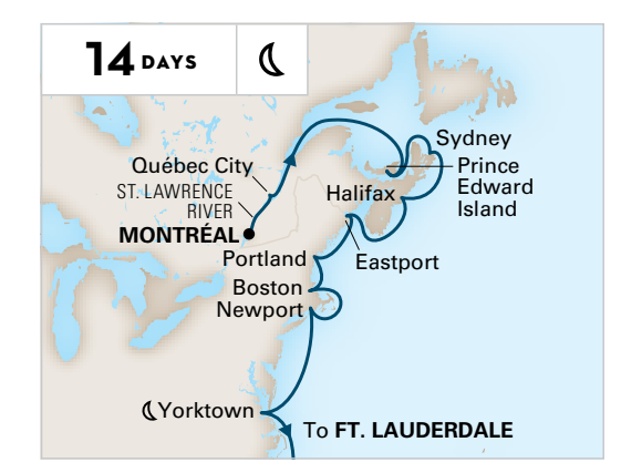
COLONIAL NEW ENGLAND & ATLANTIC SEABOARD: MONTRÉAL MONTRÉAL TO FT. LAUDERDALE Volendam Sep 28

Did you know that tiny Cap-aux-Meules is home to North America's second-largest wooden church? The wood used to build St. Pierre de La Vernière was retrieved from one of the area's many 19th-century shipwrecks and had to be blessed before being used. Hear more fascinating tales as you shop for handmade local wares, explore secluded beaches, and witness the ebb and flow of life in this far-flung corner of Québec.