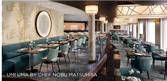
UMI UMA BY CHEF NOBU MATSUHISA

Your sophisticated home at sea, Crystal Symphony is the epitome of elegant travel. With newly renovated expansive suites, an array of social areas, and nearly one staff member per guest, Crystal Symphony offers the utmost comfort, quality, personalization and choice. Savor complimentary, world-class dining, wellness and entertainment, on this voyage of discovery.