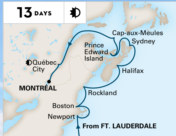
THE ATLANTIC COAST FT. LAUDERDALE TO MONTRÉAL Volendam Apr 21