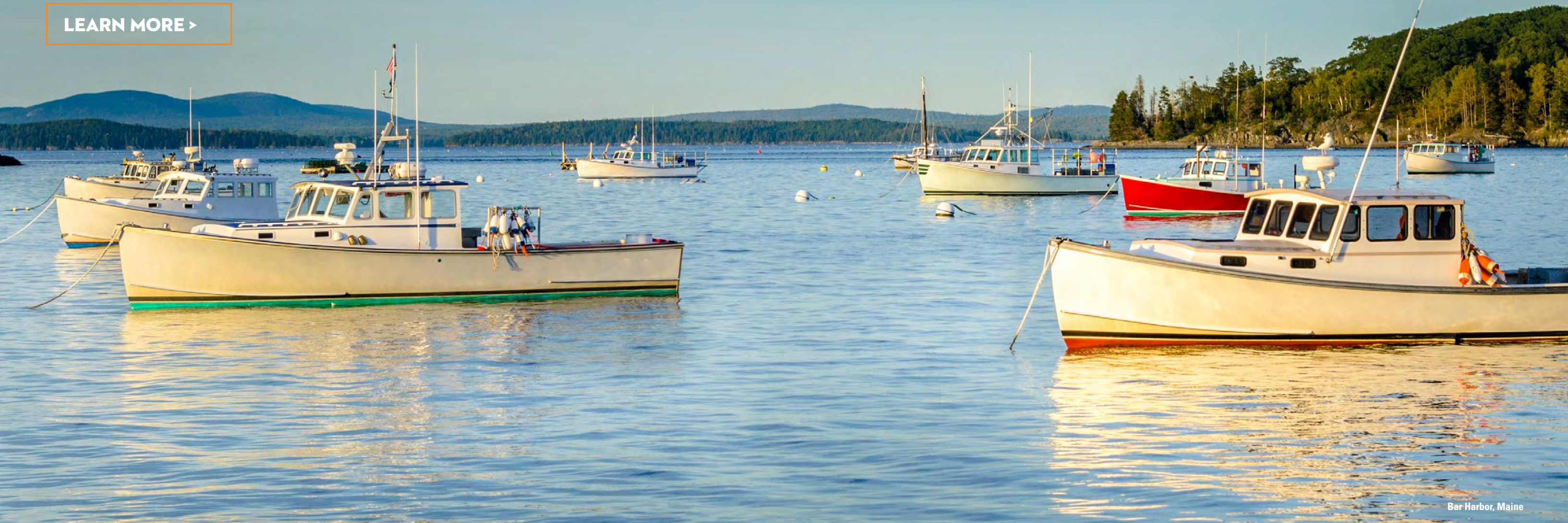
Bar Harbor, Maine