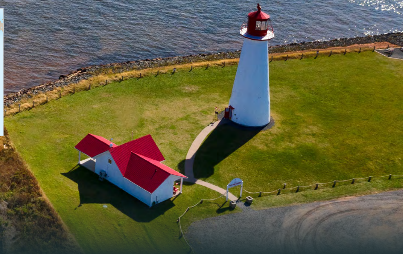
Point Prim Lighthouse, Prince Edward Island

♦ These cruises operate in reverse from Québec City to Boston; visit HollandAmerica.com for details.