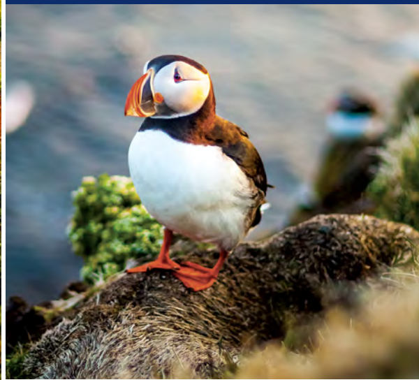
Sydney, Nova Scotia