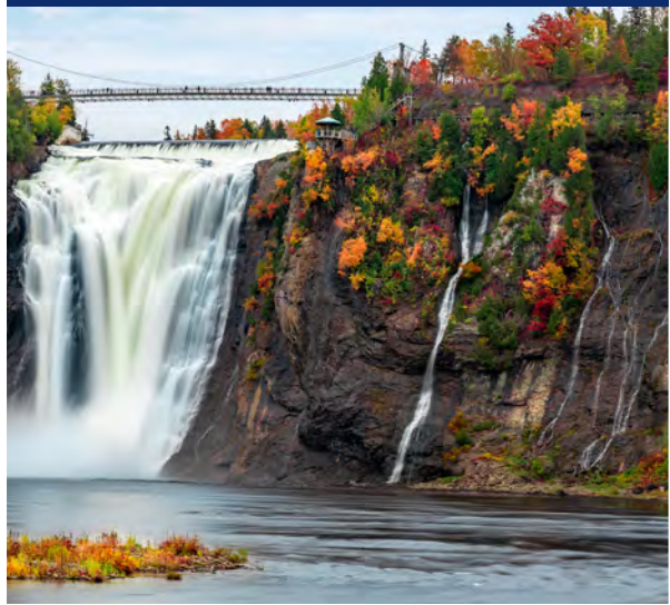
Québec City, Québec