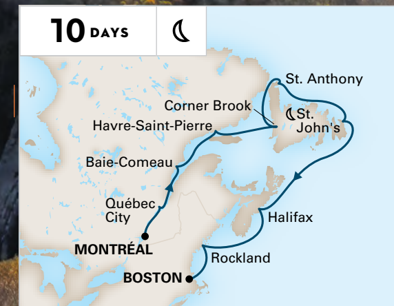
NEWFOUNDLAND & NEW ENGLAND DISCOVERY MONTRÉAL TO BOSTON Volendam Aug 31