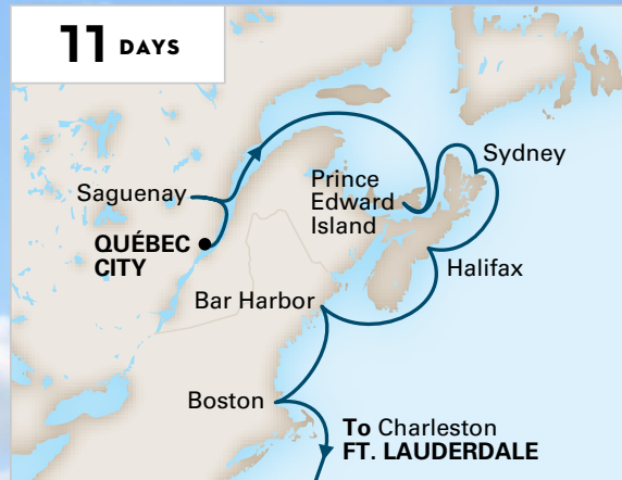
THE ATLANTIC COAST QUÉBEC CITY TO FT. LAUDERDALE Zuiderdam Oct 12

Our flexible itineraries either depart from or arrive in Fort Lauderdale, allowing you to combine your Canada & New England vacation with a cruise along the beautiful Atlantic Coast. Drive along Cape Breton's scenic Cabot Trail and visit some of New England's most iconic cities, including Bar Harbor and Boston. Relax while taking in coastal views from your private verandah and keeping watch for whales and dolphins in the waters below. However you choose to cruise, these Atlantic Coast sailings are sure to offer just what you're looking for.