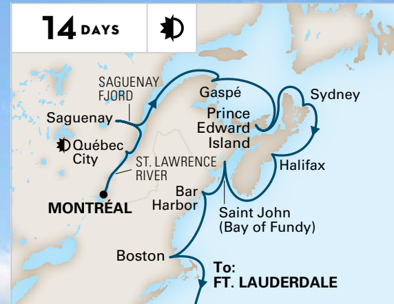
THE ATLANTIC COAST MONTRÉAL TO FT. LAUDERDALE Volendam Oct 5