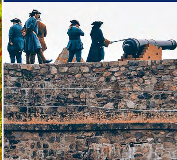
Cape Breton, Nova Scotia