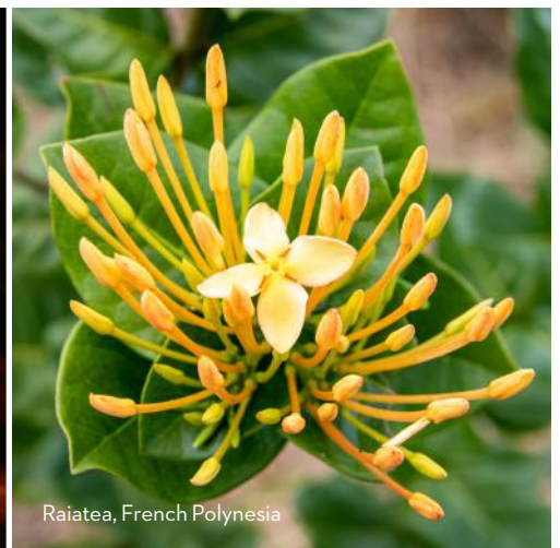
Raiatea, French Polynesia