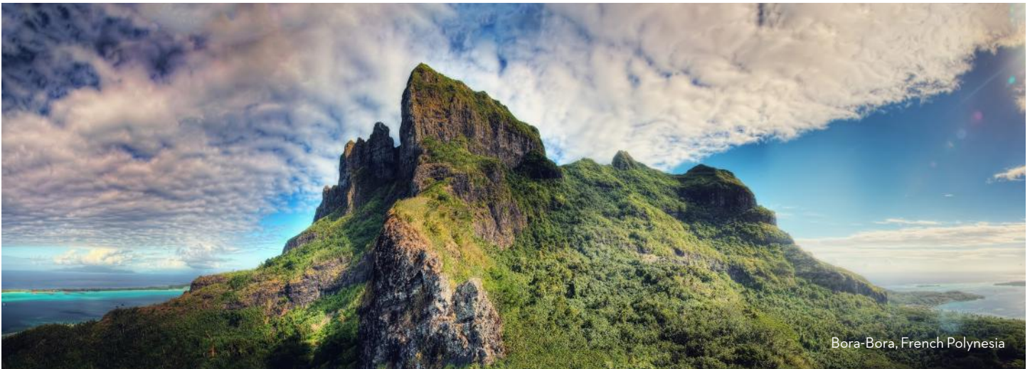
Bora-Bora, French Polynesia