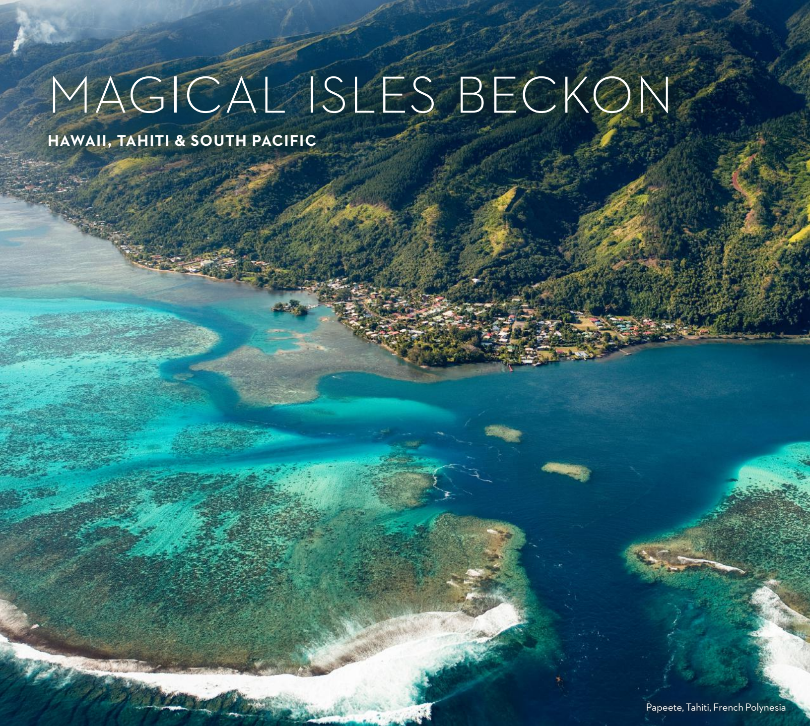
Papeete, Tahiti, French Polynesia