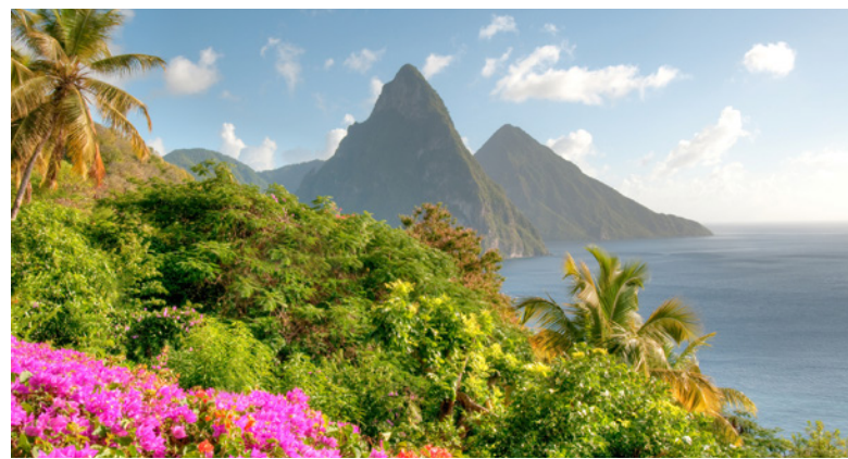
LES PITONS. TOWERING VOLCANIC PEAKS RISE OVER THE BAY OVER SOUFRIÉRE, ST. LUCIA. SET OUT ON A SCENIC HIKE OR VIEW THE STUNNING PEAKS FROM THE TERRACE OF YOUR SUITE.