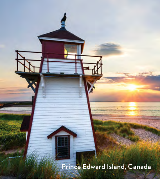
Prince Edward Island, Canada