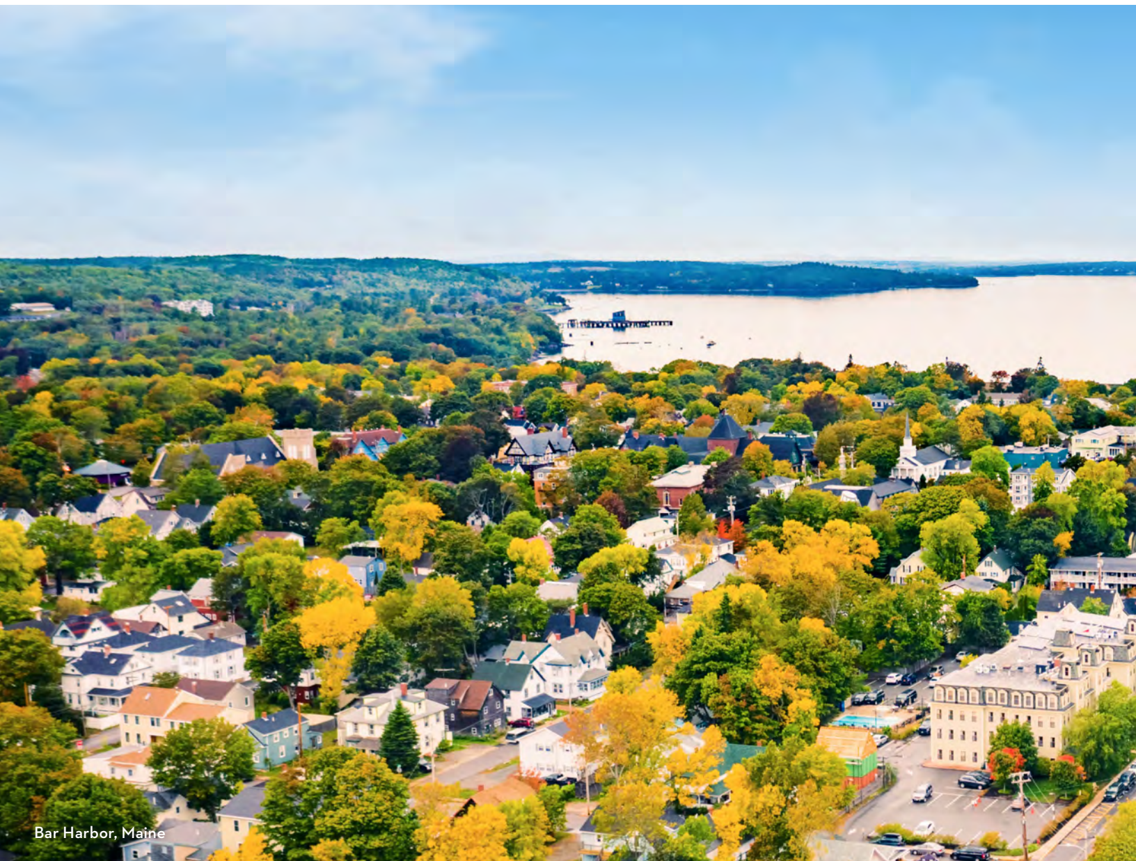
Bar Harbor, Maine