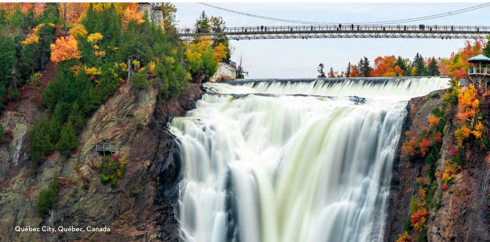
Québec City, Québec, Canada