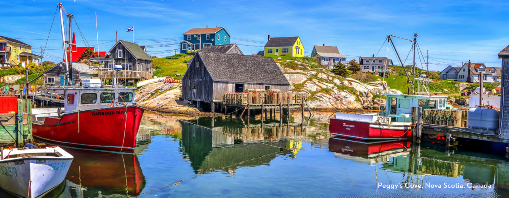
Peggy's Cove, Nova Scotia, Canada