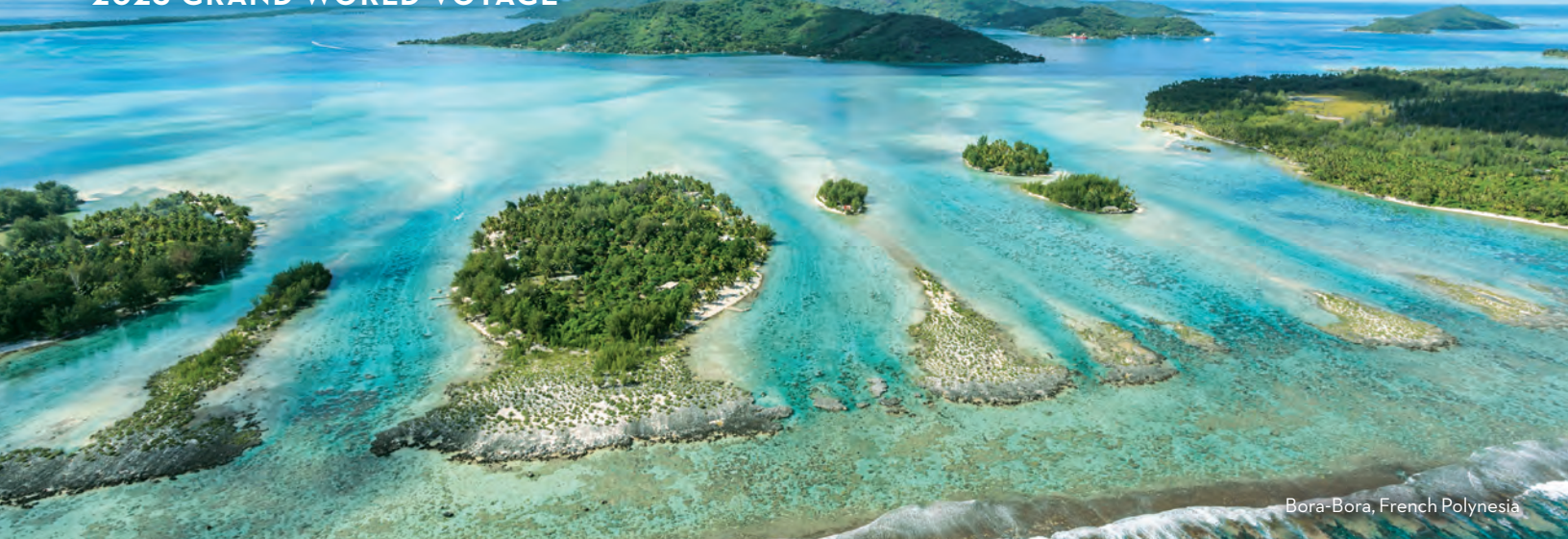
Bora-Bora, French Polynesia