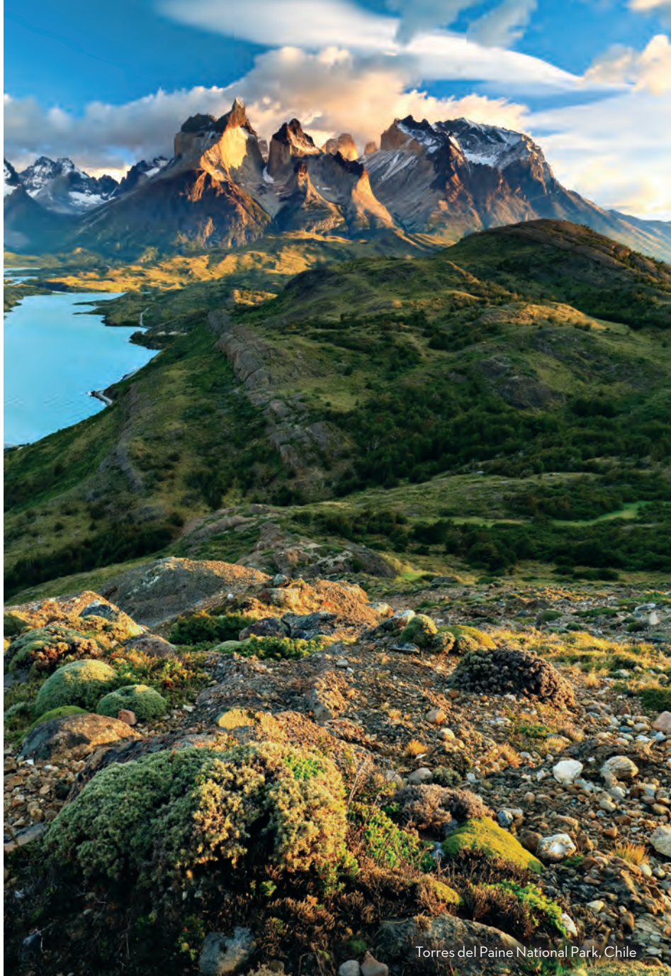
Torres del Paine National Park, Chile